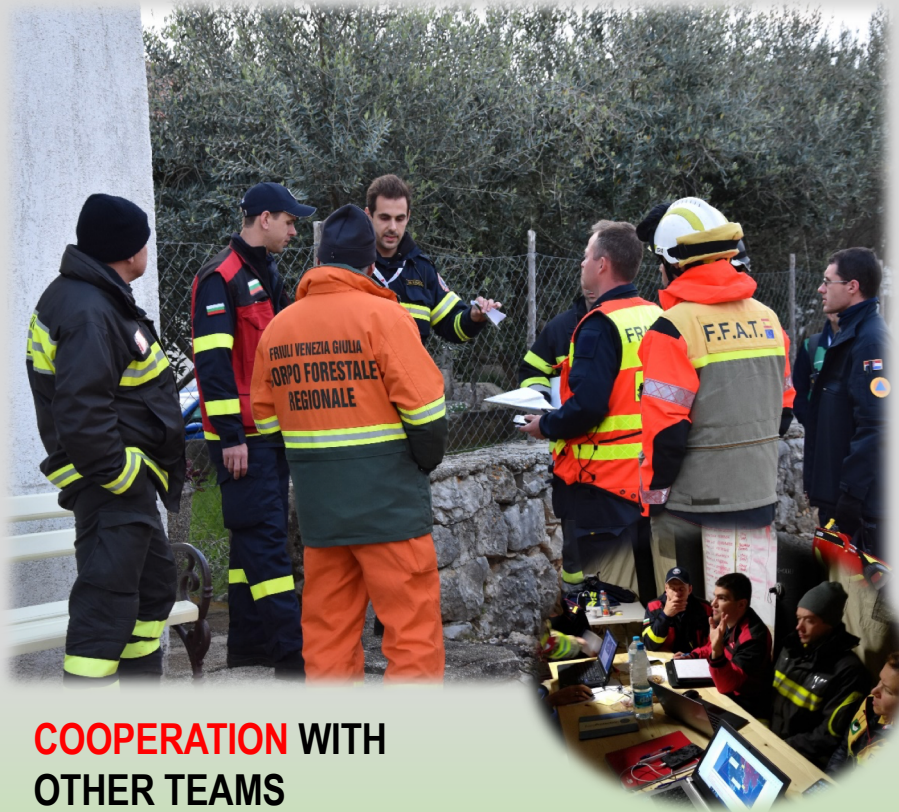
COOPERATION WITH OTHER TEAMS