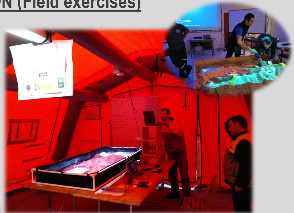
USING TECHNOLOGICAL SUPPORT TOOLS